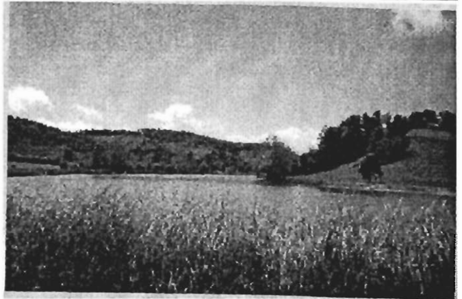
New River leading to Froggy Bottom Farm